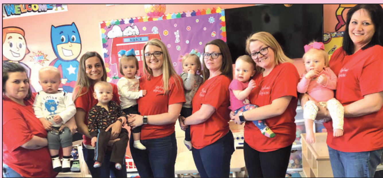
Above and below: Playtime Daycare staff members show off some of their younger 'clients'