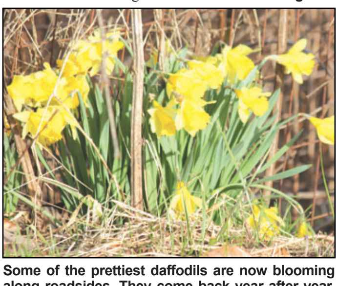
along roadsides. They come back year after year, They are the harbingers of spring. When we see a daffodil, we know that winter is soon over. The buds of the daffodils were peeking out during February marijuana in a container and March snows.