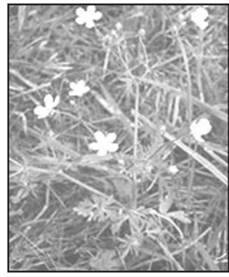
Buttercups in Pastures

New seeds are produced during the time petals are showy. If you wait until after flowers appear, it can be too late to implement control tactics. This is one reason buttercups can survive year to year and new plants emerge each year.