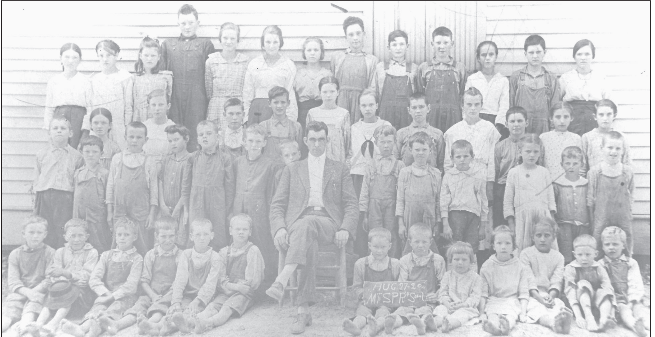
MOUNTAIN SPRINGS SCHOOL - 1921