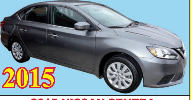
2015 NISSAN SENTRA 4-DOOR! LOADED! LOW MILES! WE HAVE FINANCING!