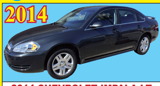
2014 CHEVROLET IMPALA LT LOADED! ONLY 49,000 MILES! LOCAL TRADE! WE HAVE FINANCING!