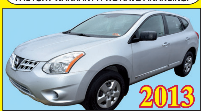
2013 NISSAN ROGUE AWD LOADED! ONLY 37,000 MILES! COME AND SEE! WE HAVE FINANCING!