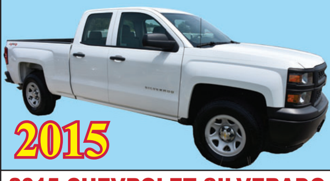
2015 CHEVROLET SILVERADO 4-DOOR, 4X4, 5.3 V8, AUTOMATIC, PW, PLKS