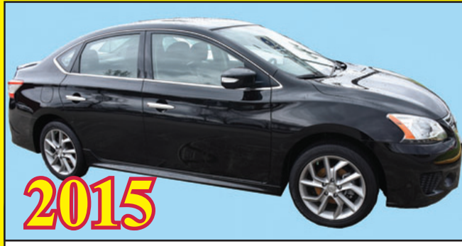
2015 NISSAN SENTRA SR 4-DOOR! LEATHER! MOON ROOF! LOW MILES! LOADED! FACTORY WARRANTY! FINANCING!