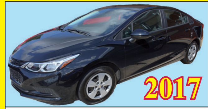
2017 CHEVROLET CRUZE LOADED! 4 DOOR! ONLY 12,000 MILES! FACTORY WARRANTY! WE HAVE FINANCING!