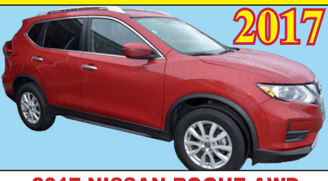
2017 NISSAN ROGUE AWD 4-DOOR! ALL WHEEL DRIVE! AUTOMATIC! LOADED! LOW MILES! FINANCING AVAILABLE!