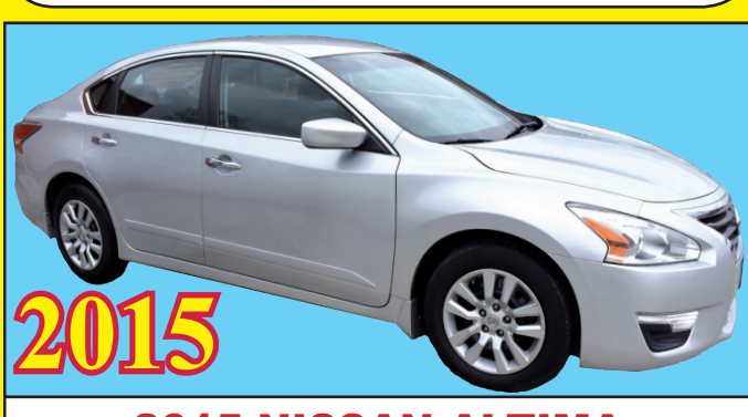
2015 NISSAN ALTIMA 4-DOOR! LOADED! LOW MILES! FACTORY WARRANTY! WE HAVE FINANCING!