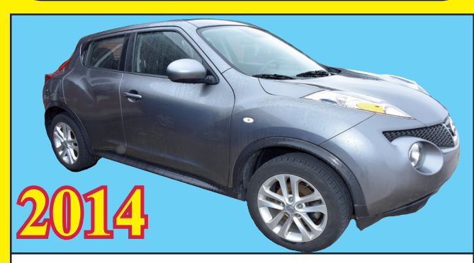
2014 NISSAN JUKE 4X4 4-DOOR! LOADED! GOOD MILES! LOCAL TRADE! WE HAVE FINANCING!