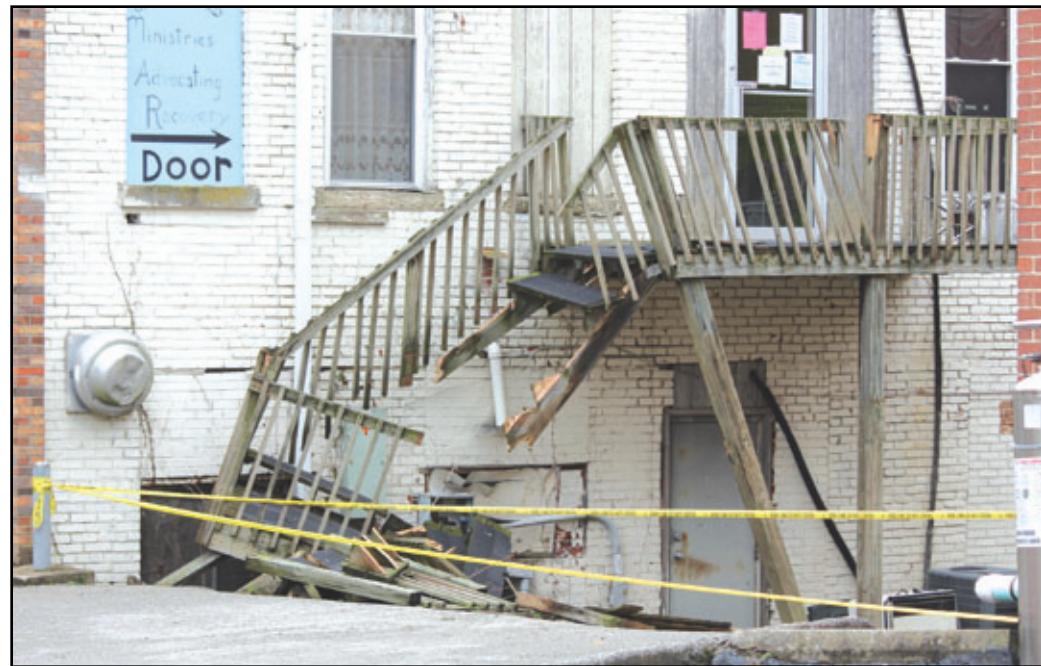
Truck vs. Building

Irvine Police Chief said no one was injured Monday morning when a truck struck and damaged the rear of the Christian Worship Center on Broadway. He said the accelerator on the truck had gotten stuck at full throttle.