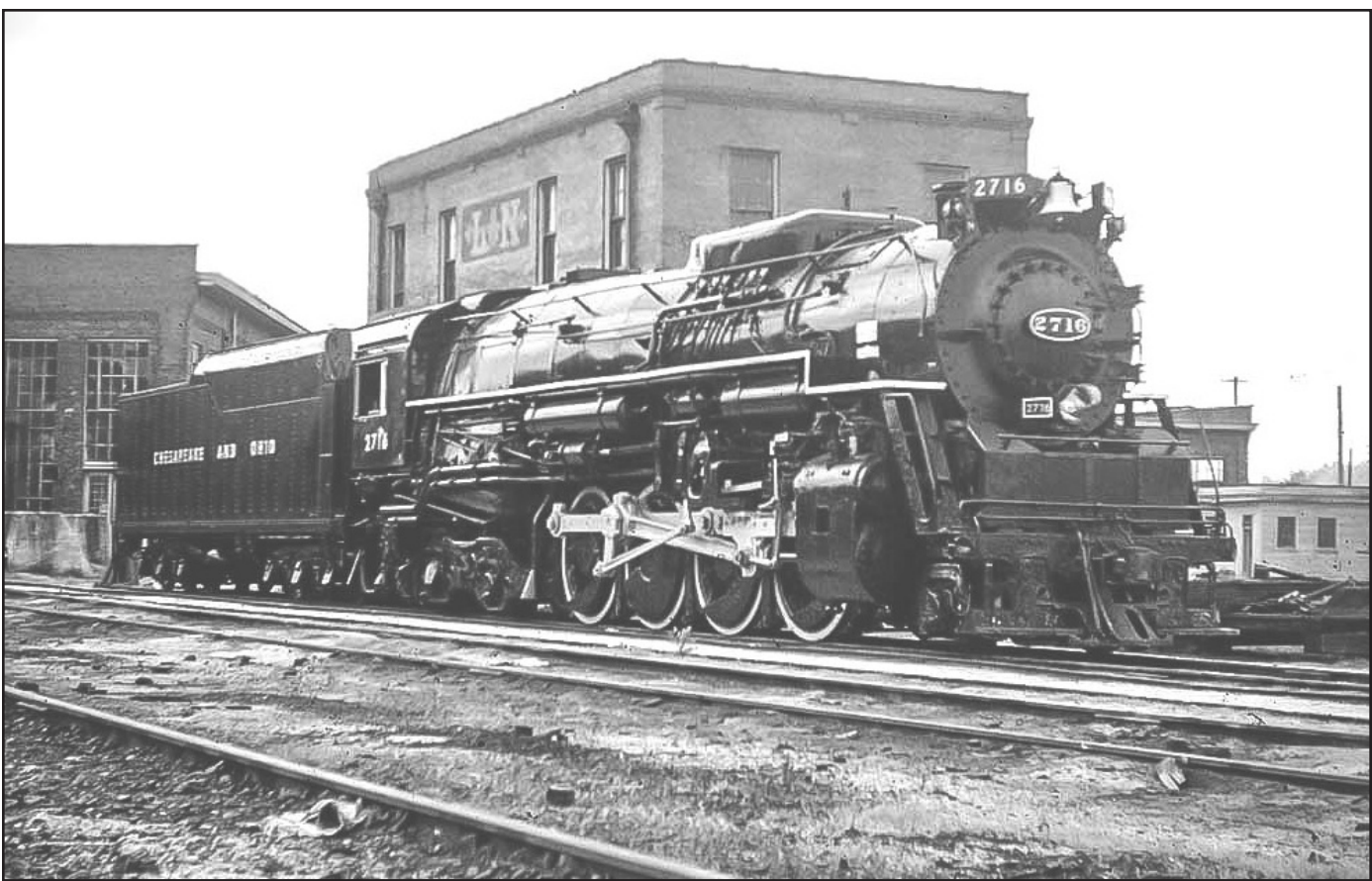
Locomotive 2716 was built in 1943 and is planned to be restored to operation 75 years later.

The move of the locomotive will be spearheaded by CSX Transportation and RJ Corman, a joint-effort that will result in photo opportunities, public tours and dis-