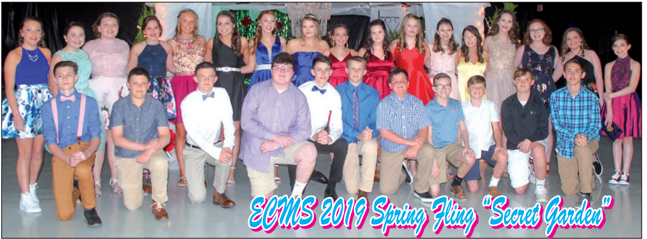
ECMS 2019 Spring Fling "Secret Garden"