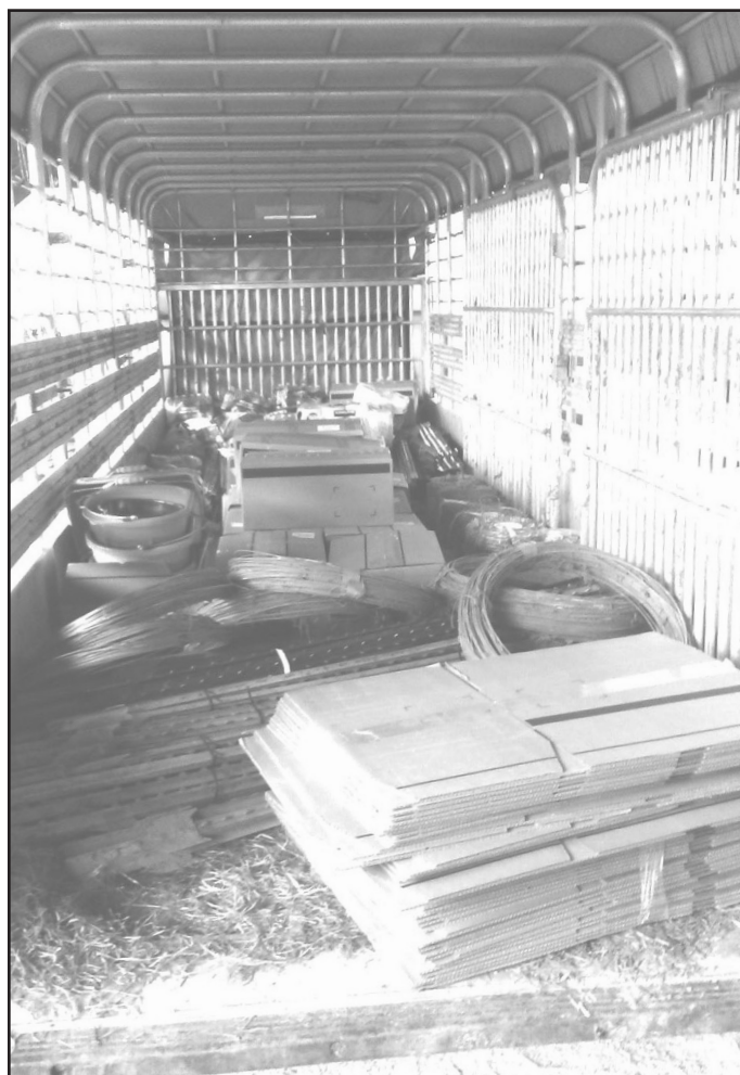
Estill County's trailer after it is loaded with supplies for Nebraska.