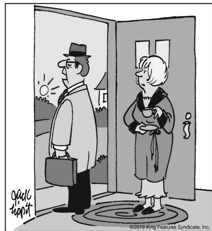
"Gimme a little shove."