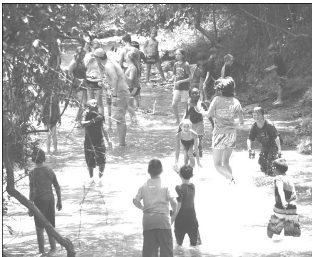
Having fun at Day Camp at Aldersgate Camp

ated by the United Methodist Church of Kentucky, Aldersgate is located about 20 minutes from Irvine, nestled on about 350 acres in the ghost town of Fitchburg in the foothills of Appalachia. It is one of the hidden jewels of Estill County. Aldersgate seeks to intentionally provide for the faith development of individuals of all ages in Christ and in the Christian community within the natural beauty of God's creation by providing opportunities for people to come and enjoy the outdoors through activities such as hiking, gaga ball, swimming, playing in the creek, fishing, low and high ropes courses, crafts, animals, prayer labyrinth, faith development, camp fires, friendship, and much more.