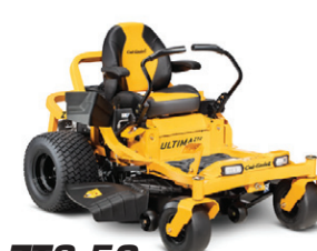
ZT2 50 ZERO-TURN RIDER