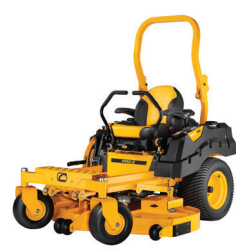
PRO Z 148L EFI COMMERCIAL ZERO-TURN Δ