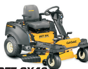
RZT SX42 ZERO-TURN RIDER