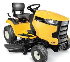
XT1 LT42 LAWN TRACTOR