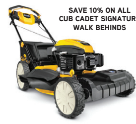
SC 300 HW SELF-PROPELLED