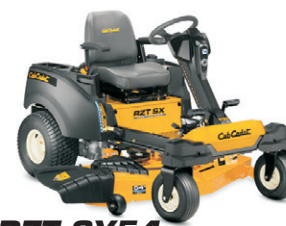
RZT SX54 ZERO-TURN RIDER