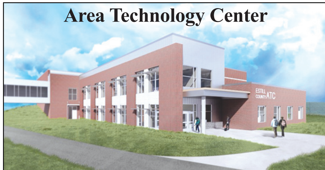
The public is invited to a ground breaking ceremony for the Estill County Area Technology Center on Friday, June 14 at 2 p.m. It will be held at 495 Engineer Drive. The photo is the architect drawing of the ATC.