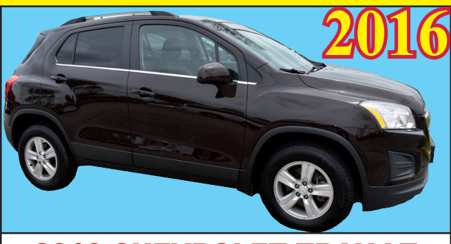
2016 CHEVROLET TRAX LT LOADED! LEATHER! "DEEP EXPRESSO MAROON!" AWD! LOW MILES! WE HAVE FINANCING!