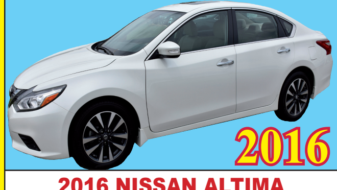
2016 NISSAN ALTIMA "PEARL WHITE!" LEATHER! LOADED! LIKE NEW! BEAUTIFUL EXTERIOR & INTERIOR! LOW MILES!