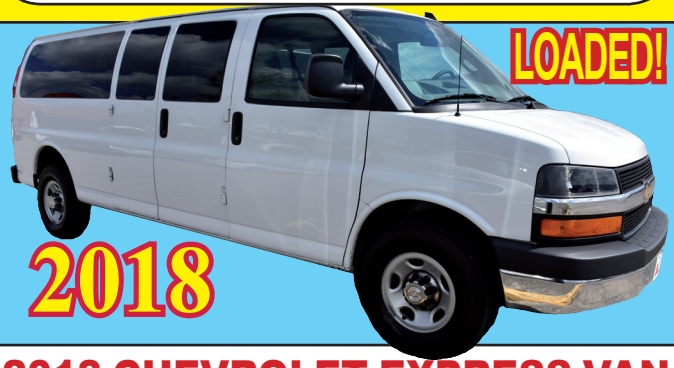
2018 CHEVROLET EXPRESS VAN DUAL HEAT & AIR! 15-PASSENGER! ONLY 24K MI! FACTORY WARRANTY! WE HAVE FINANCING!