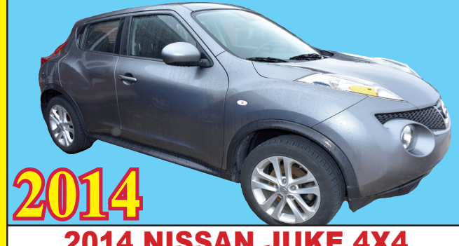
2014 NISSAN JUKE 4X4 4-DOOR! LOADED! GOOD MILES! LOCAL TRADE! WE HAVE FINANCING!