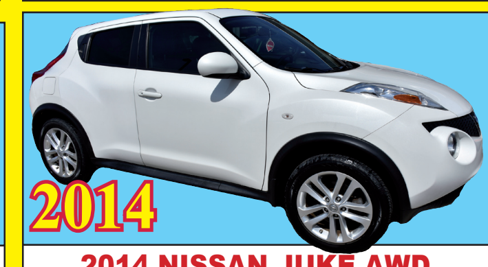
2014 NISSAN JUKE AWD LOCAL TRADE! ONLY 30,000 MILES! COME AND SEE! WE HAVE FINANCING!