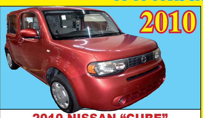
2010 NISSAN "CUBE" 4-DOOR! LOCAL TRADE! AUTOMATIC! LOADED! WE HAVE FINANCING!