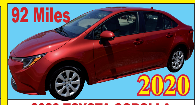
2020 TOYOTA COROLLA 4-DR LT! LOCAL TRADE! ONLY 92 MILES! LOADED! SAME AS NEW! FACTORY WARRANTY! FINANCING!