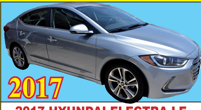
2017 HYUNDAI ELECTRA LE 4DR, LOADED! ONLY 15K MILES! LIMITED EDITION! FACTORY WARRANTY! WE HAVE FINANCING!