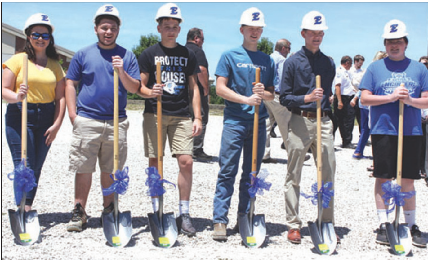
The first group to shovel dirt at the ground-breaking for the new Area Technology Center were students from Estill County High School.

the tournament, scoring 61 runs and giving up only 23 runs. The Lady Neers are now 11-0 for the 2019 Travel Ball Season.