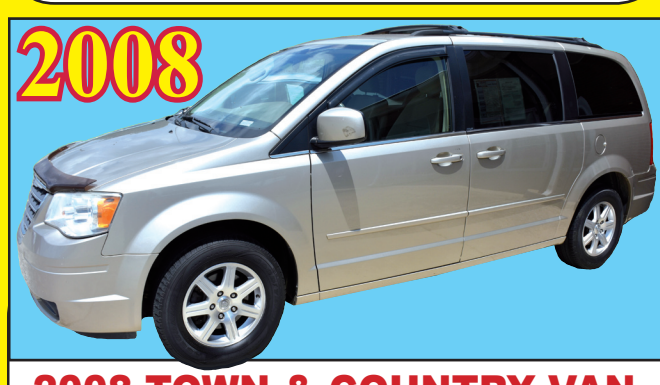
2008 TOWN & COUNTRY

4-DOOR AND LOADED! FACTORY WARRANTY! WE FINANCE!