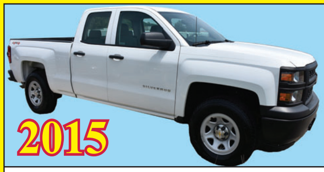
2015 CHEVROLET SILVERADO 4-DOOR, 4X4, 5.3 V8, AUTOMATIC, PW, PLKS ONLY 28K MILES! WARRANTY! FINANCING!