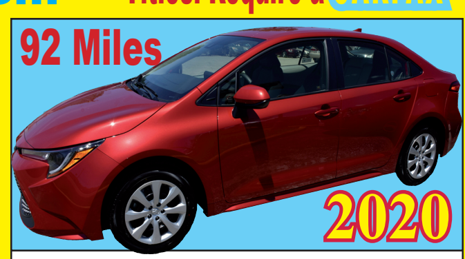
2020 TOYOTA COROLL

4DR, LOADED! ONLY 15K MILES! LIMITED EDITION! FACTORY WARRANTY! WE HAVE FINANCING!