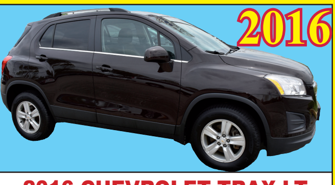
2016 CHEVROLET TRAX LT

4-DR LT! LOCAL TRADE! ONLY 92 MILES! LOADED! SAME AS NEW! FACTORY WARRANTY! FINANCING!