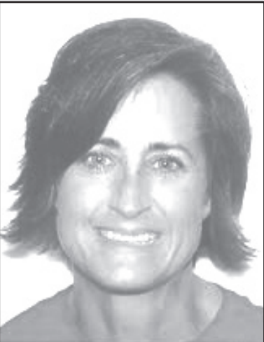
by Dawn Reed E. Ky. Columnist

As I boarded the plane, a flight attendant told me to put my carry-on in the First Class overhead compartment. I wasn't IN First Class, there was just room there for storage. Unfortunately, I couldn't get it in the bin. I pushed and shoved but it wouldn't budge. People were everywhere! All eyes were on me; I was holding up boarding traffic. As I wrestled with my bag-