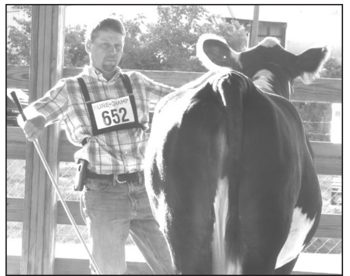
L.W. Beckley exhibits at the Estill County Fair