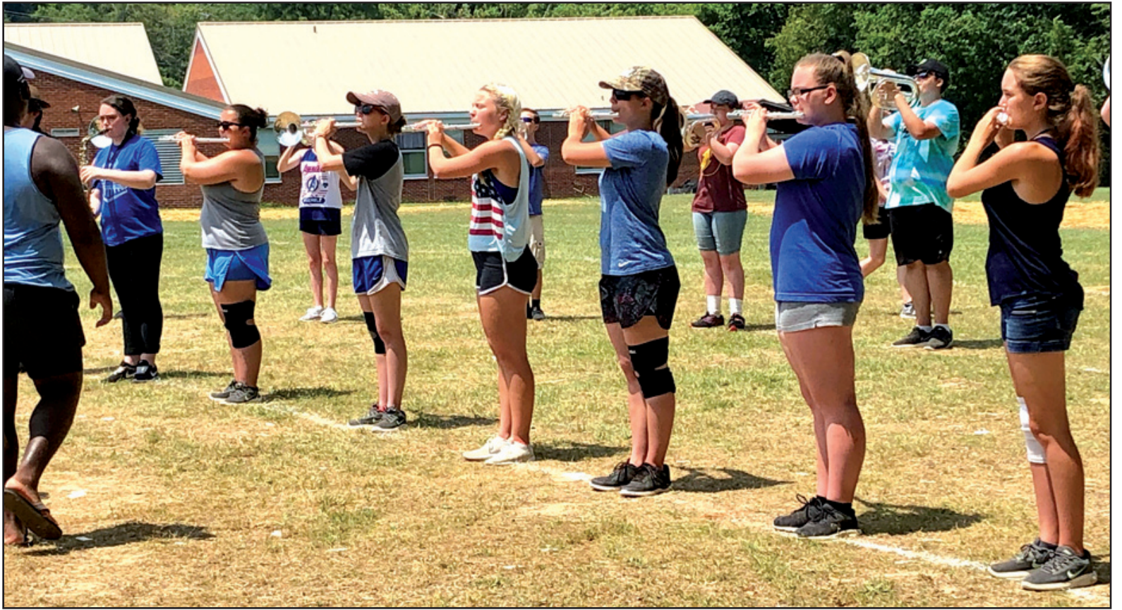
The Marching Engineers began their second week of band camp on Monday morning.

Gabby Calvin of the woodwind staff stated, "It's really a great show and the kids have worked super hard over the past week."