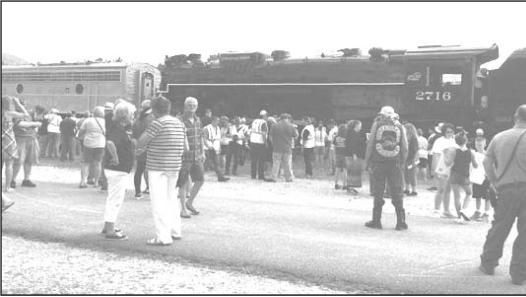
This photo shows part of the Clinchfield 800, a diesel engine, which pulled steam engine 2716 to Ravenna.