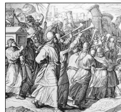
— JOSHUA 21:43-45

So the Lord gave to Israel all the land of which He had sworn to give to their fathers, and they took possession of it and dwelt in it. The Lord gave them rest all around, according to all that He had sworn to their fathers. And not a man of all their enemies stood against them; the Lord delivered all their enemies into their hand. Not a word failed of any good thing which the Lord had spoken to the house of Israel. All came to pass.