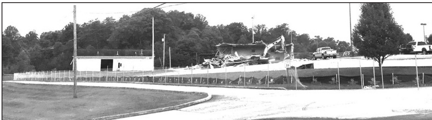
Demolition of the old Estill County Schools' garage was nearly complete on Tuesday.

"It wasn't the noise, Mom," the boy replies. "She ate all my bait."