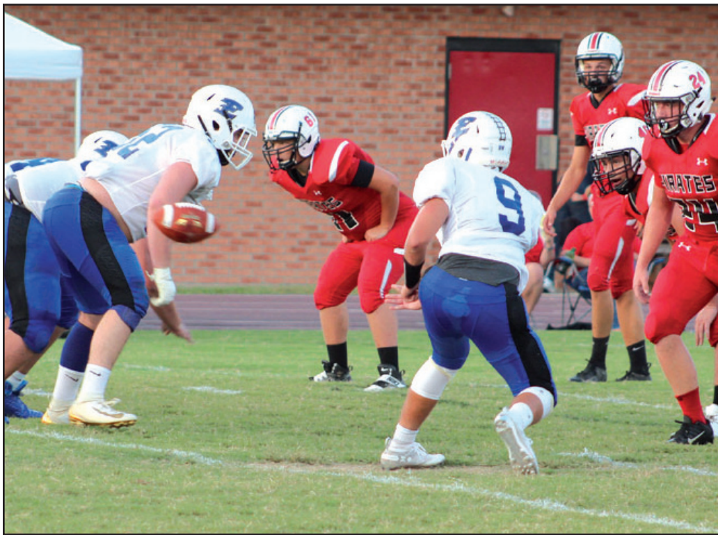
The Engineers rolled into Powell County on Friday night looking for their first win of the season. They led the Pirates the entire game and finished off with a score of 36-14.