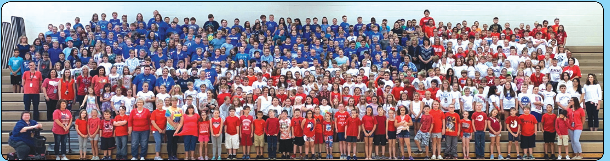
West Irvine Intermediate observed Constitution Day on September 17 with students and staff dressing in red, white, or blue. They then formed an American flag in the gym.