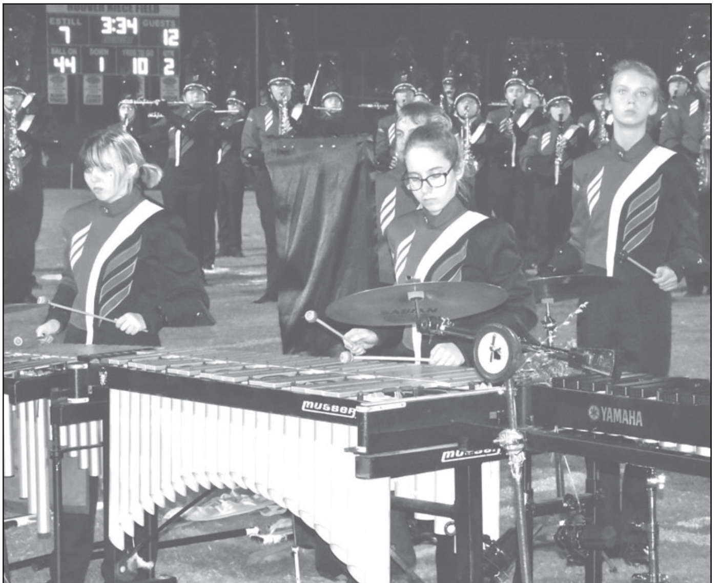
The Estill County Marching Engineers perform in front of the home crowd at Hoover Niece Field in Irvine.

The Marching Engineers will be honing up their skills on the practice field this week in preparation for competition at Pulaski County in Somerset next week against some west-central bands. Estill will be competing in Class AAA against Wayne County, Marion County, and Glasgow. Two 4A bands, Southwestern and Barren County, will also be competing. Somerset, Danville, and Harlan will be competing in Class A, while Knox Central will be the only 2A band scheduled.