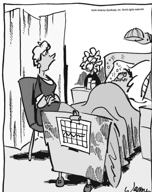
"I've destroyed the recipe."