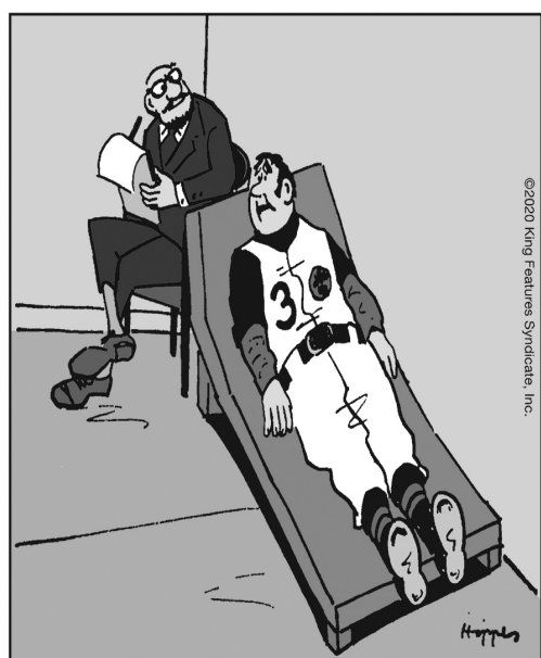
"I get a guilt complex stealing bases!"